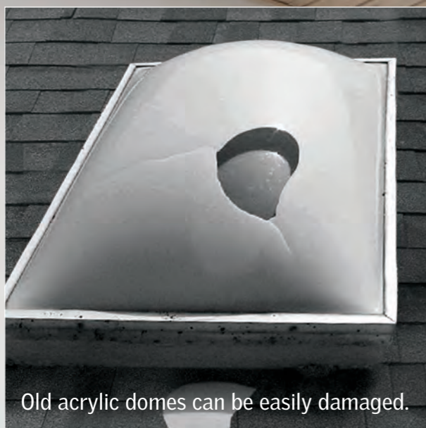
Old acrylic domes can be easily damaged.