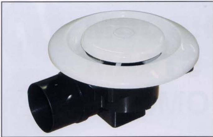
Round Diffuser - Model RD